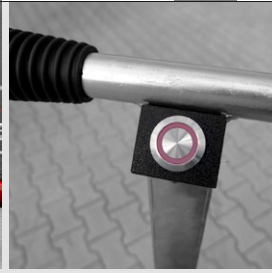
WORK button on the handle