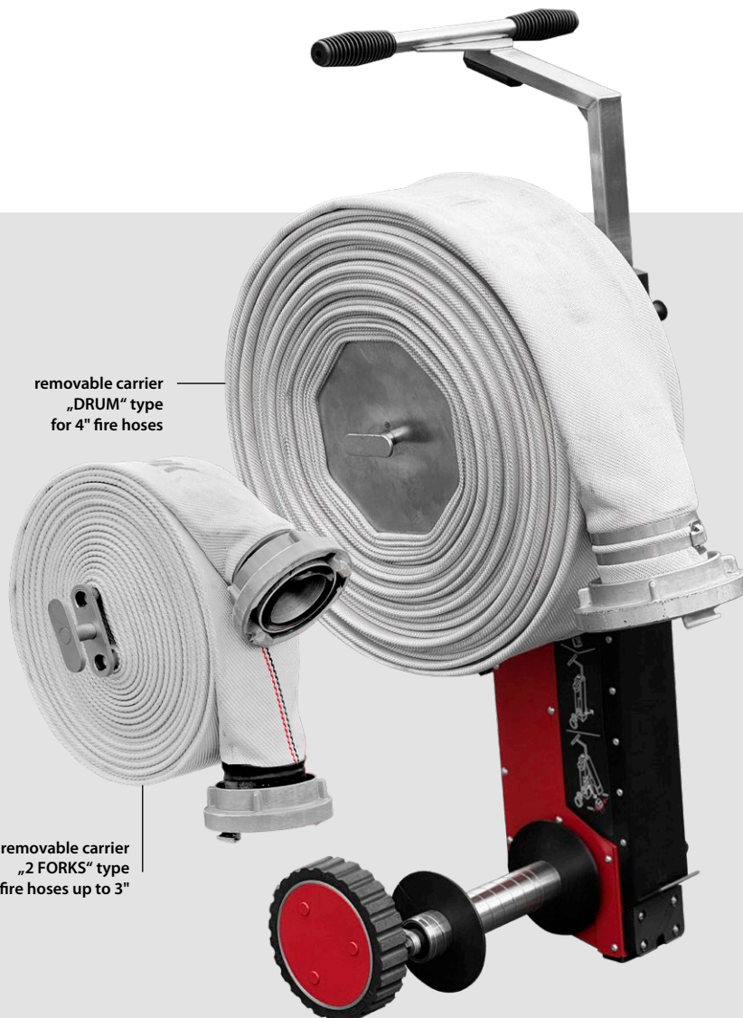
removable carrier „DRUM“ type for 4" fire hoses