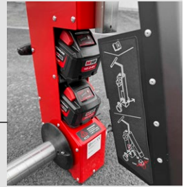
Electric motor powered by Milwaukee batteries