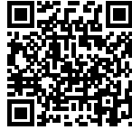
Quick Release Mechanism