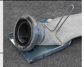
Hose protector protects the fire hose and coupling against fraying during winding