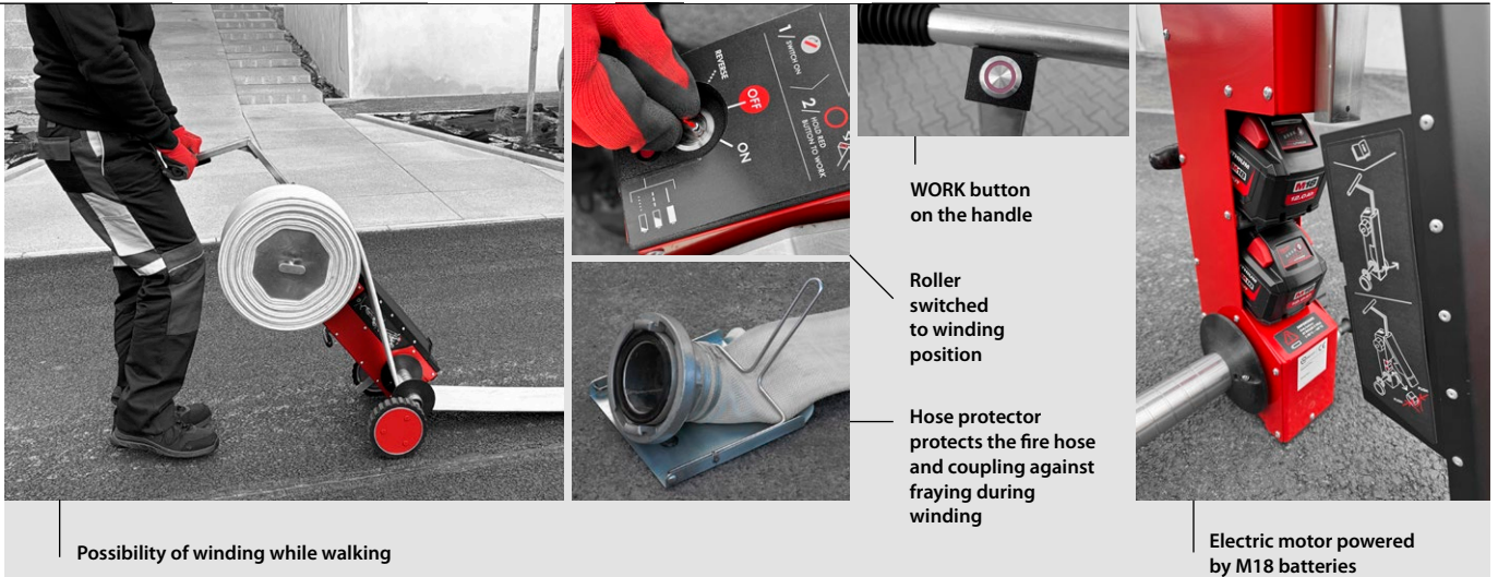
Possibility of winding while walking