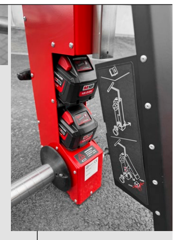
Electric motor powered by 18 V batteries

Hose protector protects the fire hose and coupling against fraying during winding