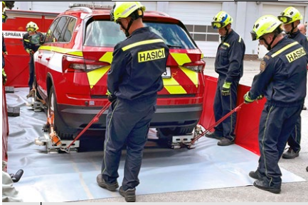
The side walls of the container can only be finally assembled after the car is placed in the container area. Then the container is filled and the car is flooded.

Quarantine Container assembly instructions