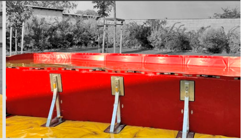
Quarantine Container filled with water. Volume 3,804 gal.