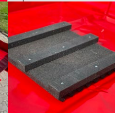
The mats are designed mainly for placement in the decontamination spill bunds IZS