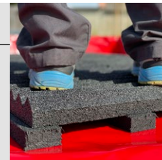
Recommended storage method