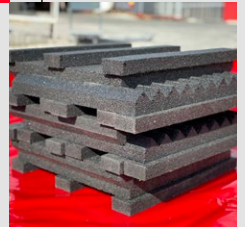
Detail of the surface structure