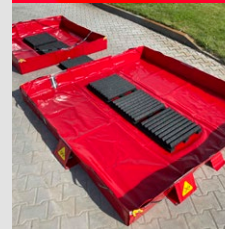
Examples of use